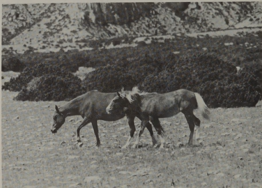
In September 1968, Interior Secretary Stewart Udall designated an area in the Pryor Mountains as America's first wild horse range. Two more ranges have since been designated, one in Nevada and another in Colorado.

In accordance with the requirements of Federal law, wild horse management on the Pryors has been at the minimal feasible level to maintain the wild free-roaming nature of the animals. To protect